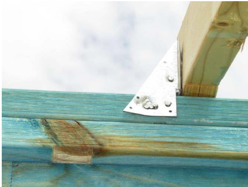
Example of framing anchor not correctly nailed off and fixed to ribbon plate only